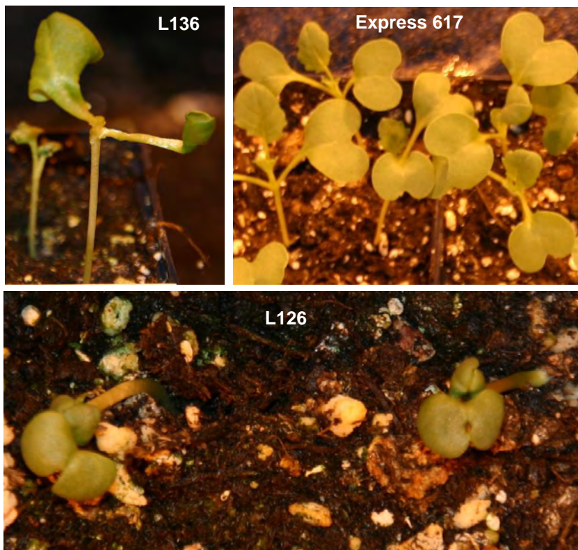
Figure 1. Typical phenotypic defects of six representative DH lines with high content IAA as comparing to Express 617 at 7 DAS. The mutant phenotypes vary from ostrich-like seedling (L62), severely chlorosis/chlorotics leaves (L13, 117, 136, 126), ectopic trichome (L117) or twisted/curled cotyledon (L136)